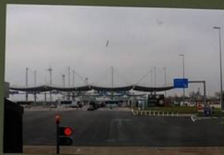
Before the shuttle

During the journey, we slept at night and night and then we played on DS and we watched films and series and Musik and spoke to our friends.