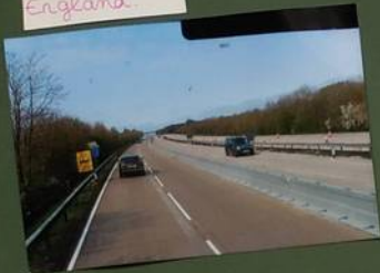
Motorway in England