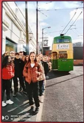
In the museum there's a bus you can take to move around the village.

The Black Country Living Museum is a reconstitution of a village during the industrial revolution. This is the name given to the movement in which machines changed people's way of life.