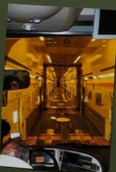
In the shuttle

The journey started at 1.40 A.M. We were very impatient to use the Eurotunnel. We took the shuttle from Coquelles to Folkestone. It was very hot into the Shuttle. We crossed the English Channel.