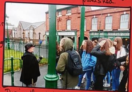
During the visit, we saw animators and actors who were disguised who explained the IR.

In the museum, there's a fake mine but it was exactly like in real life. The effects of shakes surprised us but it was rather fun. The animators explain us the life conditions of the miners at work. It was very interesting and adventurous.